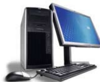
HP xw8600 WORKSTATION

HP reliability and AMD Opteron™ processor performance combine in a 2U server for simplified management and powerful computing.