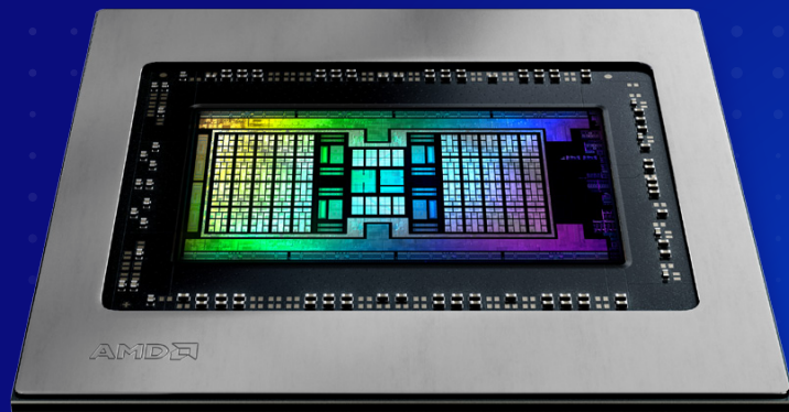
AMD RDNA™ 2 graphics processor within the high performing AMD Radeon PRO W6800.